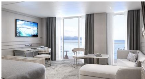
Penthouse Suite with Verandah (42.5 m 2 / 457 ft 2 )