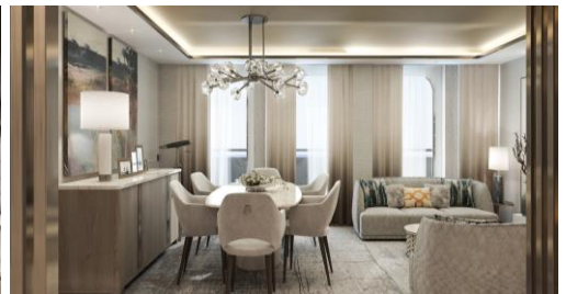
Owner's Suite with Verandah (105 m 2 / 1,130 ft 2 )