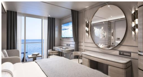
Deluxe Suite with Verandah (28.3m 2 / 304 ft 2 )