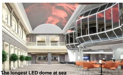
The longest LED dome at sea

7 nights cruise accommodation with meals and selected onboard entertainment 7晚郵輪假期連食宿及特選船上娛樂