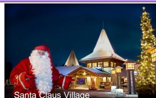
Santa Claus Village

Free at leisure before transfer to the airport at the evening for catching your flight home. Arrive HK the next day.