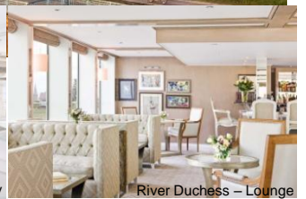
River Duchess – Lounge