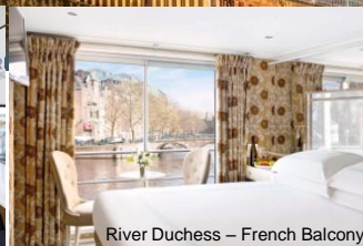
River Duchess – French Balcony